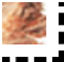
Figure 4: content-box