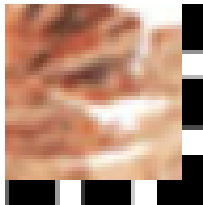
Figure 3: padding-box