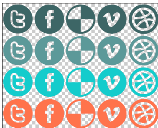
Figure 1: CSS Sprites

For example, consider the following image, It has 20 icons of different colors, each of 76x76 pixels and the whole image is 384x310 pixels.